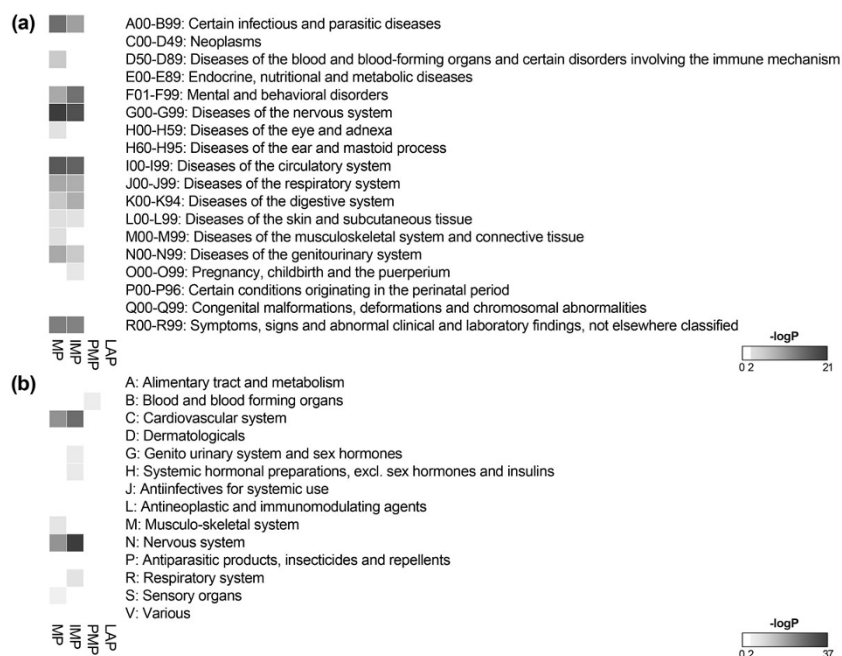
Figure 2 Heatmap representing the degree of associations between disease/therapeutic classes and membrane proteins. The disease associations were measured with first level classes of the ICD-10-CM, which were used to integrate the disease and drug information (a). For the therapeutic associations, the first level codes of ATC, which were used for the classification of integrated drugs depend on their therapeutic characteristics, were used (b). The degree of association was measured by hypergeometric test with FDR multiple testing correction. Only significantly enriched results with p-value below 0.01 are colored in the diagram. MP means all membrane proteins in this database.

external databases. Each annotated feature in the protein information page can also be used to search for other proteins that have the same feature, by clicking the search icon next to the feature. Users can also retrieve the integrated source information which is reason for collecting the protein as a membrane protein and allocating the protein with current class annotation.